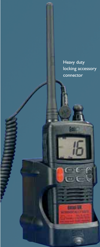
Heavy duty locking accessory connector